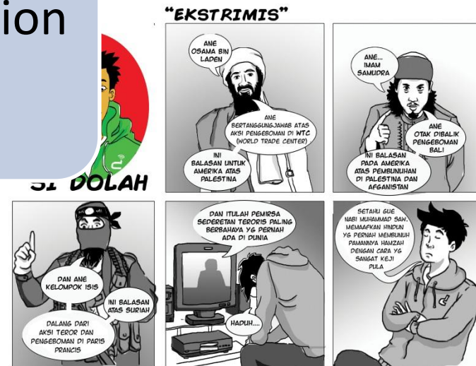
#KomikSiDolah oleh @BingsSnusie #IMC2